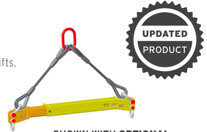
SHOWN WITH OPTIONAL TOP RIGGING & SHACKLES