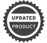
LIFTING BEAM - LOW HEADROOM ADJUSTABLE