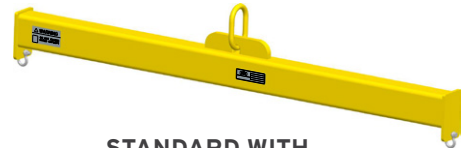
STANDARD WITH SHACKLES