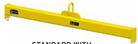
STANDARD WITH SHACKLES