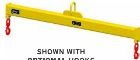
SHOWN WITH OPTIONAL HOOKS