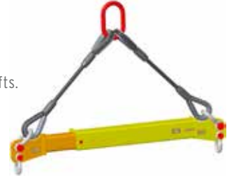
SHOWN WITH OPTIONAL TOP RIGGING & SHACKLES