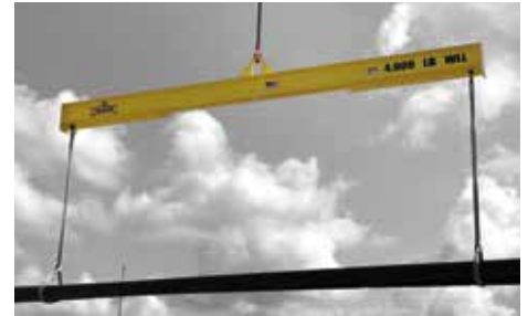
LIFTING BEAM - LOW HEADROOM ADJUSTABLE