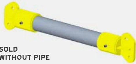
SOLD WITHOUT PIPE