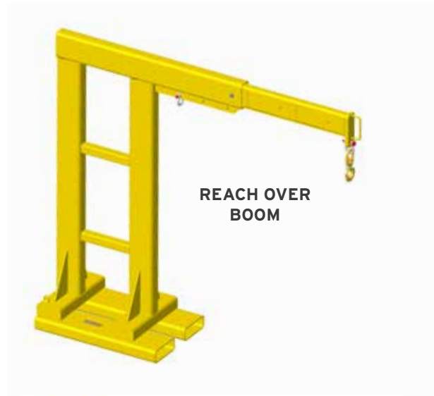
REACH OVER BOOM

EACH BOOM WITH MAST TIE OFF LOCATION, MAST TIE OFF CHAIN SOLD SEPARATELY